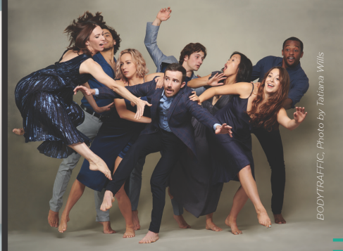
BODYTRAFFIC, Photo by Tatiana Wills

A weekend of inventive, contemporary, and classical dance from world-class performers.